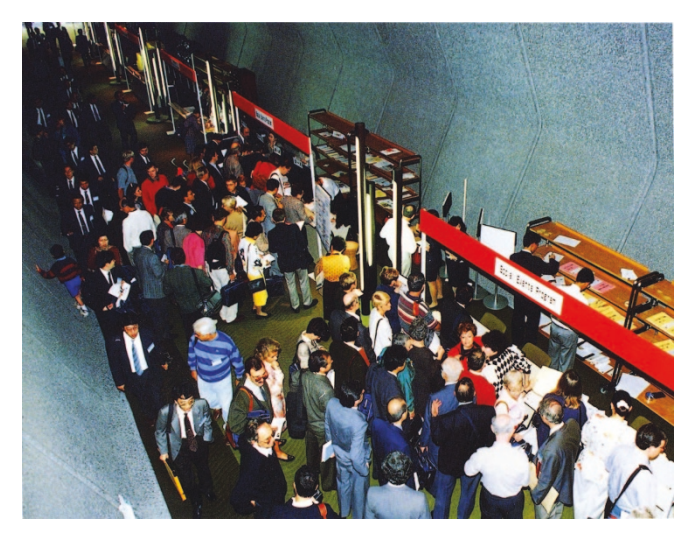
FIGURE 4. Reception for registration.