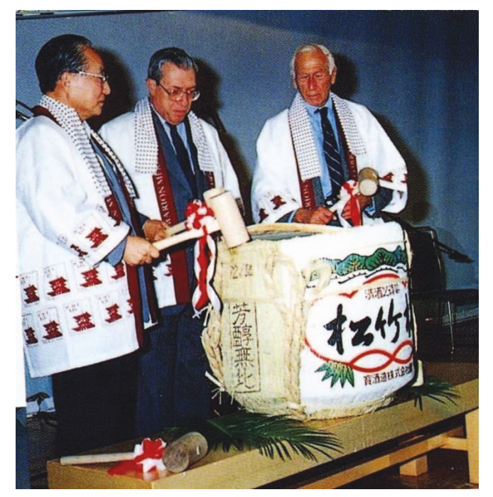
FIGURE 9. Breaking of barrel of Japanese sake at get together party.

garden, east Kyoto garden, Japanese culture course, Nara full day tour, Hozu rapid shooting, and lunch at Shozan. An excursion and get together party was held at Otsu Prince Hotel near Lake Biwa on October 16 with about 1500 participants. The guests were taken to the hotel via 3 routes; namely through Mt. Hiei, Sanju-Sangendo and Kiyomizu temple, and Daigo Sampoin Temple and Fusimi Momoyama castle. From the hotel, the guests enjoyed the excursions by boat on Lake Biwa before the party. The party started with few official addresses, breaking of the Sakadaru (barrel of Japanese Sake) (Fig. 9) and Kampai (toast). All delegates and guests spent an enjoyable evening relishing buffet style dishes and drinking various kinds of liquor including sake.