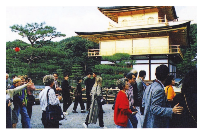
FIGURE 8. Sightseeing at Silver Temple in Kyoto.