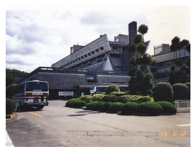
FIGURE 3. Kyoto International Conference Center (main hall of Congress).

The ICACI XIV was held from October 13–18, 1991, in Kyoto at the Kyoto International Conference Centre (KICC) (Fig. 3) and the adjacent Prince Hotel. The conference had a total of 3500 delegates from 52 countries (Fig. 4). On October 13, the Opening ceremony and Welcome reception were held at the KICCs main congress hall. The Opening Ceremony commenced with a Koto (Japanese harp) perfor-