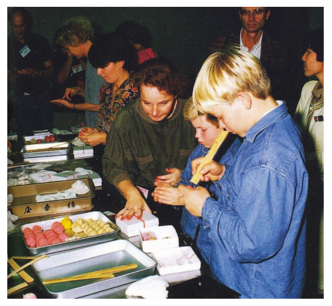
FIGURE 7. Japanese sweet making.