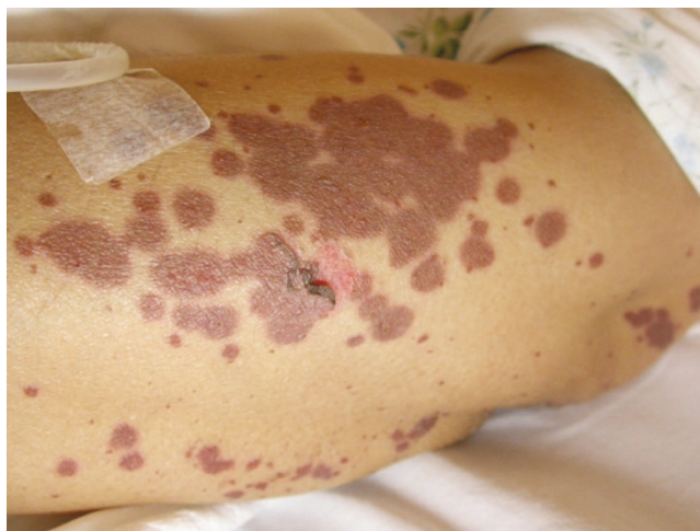
FIGURE 2. Nikolsky's sign.

Turmeric is a bright yellow spice from the root of Curcuma longa , used for centuries in India as a spice, food preservative, or herbal medicine. Turmeric extracts are known to be safe in animal studies, although hepatotoxicity has been reported after ingesting large amounts. 3 Curcumin has a potential therapeutic value for controlling allergic responses resulting from exposure to allergens by diminishing the Th2 profile, 4 and it induces keratinocytes apoptosis through different pathways including the Fas receptor and NF- \kappa B. 5 Recently, Lee et al 6 showed that curcumin inhibits syk kinase-dependent signaling events in mast cells and contribute to its antiallergic activity. However, the pro-apoptotic and antiproliferative properties of curcumin may hypothetically facilitate or even cause the onset of SJS, an allergic reaction independent of mast cells. Whether the curcumin