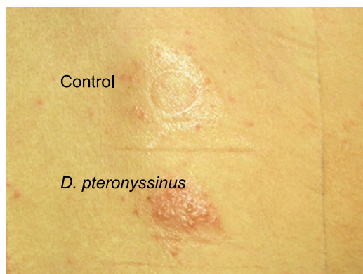
Allergen 200 IR/g in petrolatum

Allergen concentrations of 500, 3000, 5000, and 10,000 protein nitrogen units (PNU)/g in petrolatum were compared in another study 56 in 57 patients. The frequency of clear-cut positive APT reactions was significantly higher in patients with eczematous skin lesions in air-exposed areas (69%) as compared with patients without this predictive pattern (39%; P = 0.02 ). In the first group, the maximum APT reactivity was reached at a lower allergen dose of around 5000 PNU/g.