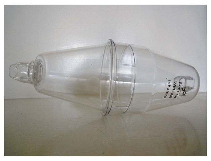
FIGURE 1. Asthm Yar.

The valved holding chamber devices used in this study were consistent with a polycarbonate volumatic (750 mL, Asthm Yar; Farafan Engineering Company, Tehran, Iran) (Fig. 1) and a polycarbonate nonvolumatic (140 mL, Dam Yar; Fanava Teb Espadana Co, Isfahan, Iran) (Fig. 2) valved holding chambers. Salbutamol 100 µg per dose pMDIs (Ventalex HFA, Sina Daru, Iran) was used with each valved holding chamber. The washing method was based on what