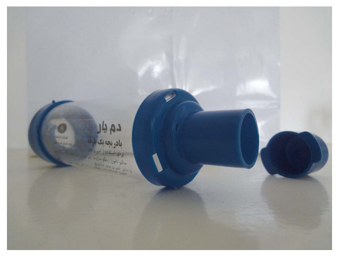
FIGURE 2. Damyar.

Mazhar and Chrystyn<sup>12</sup> have proposed in their study. The valved holding chambers were washed in warm mild detergent, soaked in water, and left to air dry before use. The patients used the devices with mouthpieces.