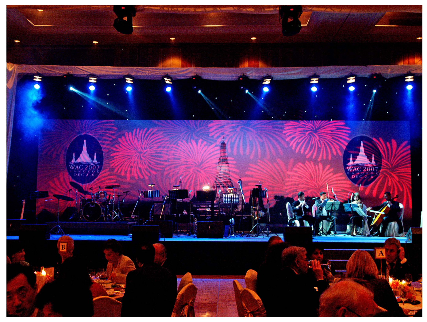
FIGURE 6. The Gala Dinner of WAC 2007 at the Royal Navy Hall.

One of the main events to remember was the presidential dinner. The event was held at the Royal Navy Hall overlooking the Chao Phya River bend (the main river of Bangkok) (Fig. 6).